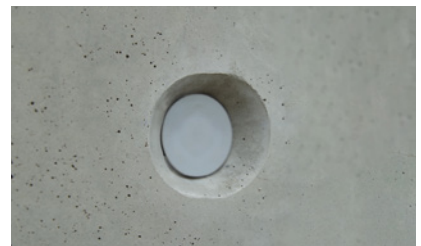
No additional finishing or after-treatment required