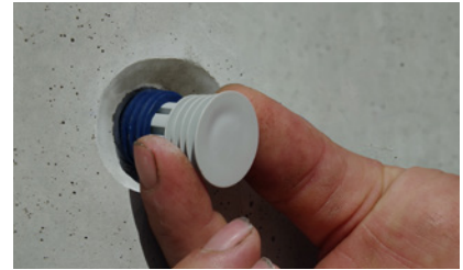
Position the Sealing Plug in the formwork spacer