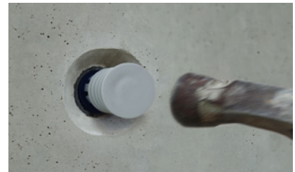
Hammer the Sealing Plug into the formwork spacer