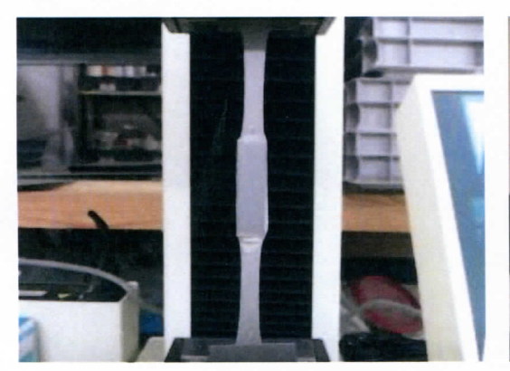
At elongation 100%

Break in the Triton COLFLEX strip. The overlap remains intact.