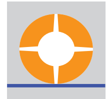
Cast in place

The tubing is then placed on the flat surface and fixed onto the concrete with clips at approximately 200 to 300mm centres throughout the required length. At either end of the hose, there are 200mm-500mm lengths of hose, these are colour coded blue and clear, this helps to identify where one length starts and the other end finishes. There are two alternative ways of forming the injection points. The standard way is for these lengths to be placed through the formwork to provide easy access when the injection work is required.