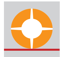
After cleaning out Injection