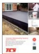
Triton BS8102 (2009) Type A Barrier Protection.