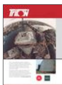
Triton Concrete Waterproofing Systems